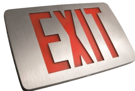
CAS Thin Die-Cast Aluminum Exit