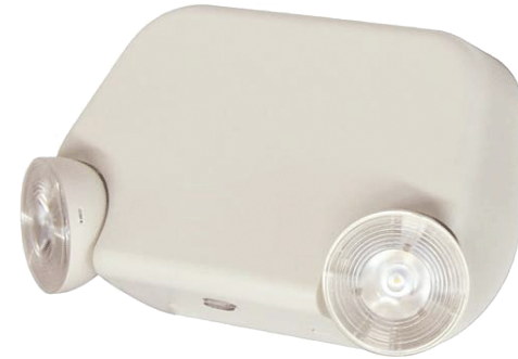
EM3-LED LED Emergency Unit