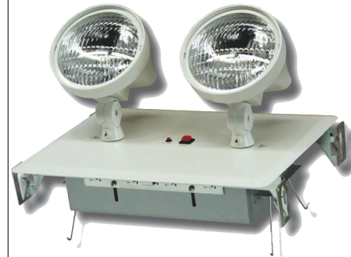
EM3R Recessed Steel Emergency Unit