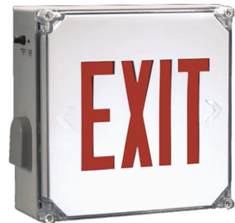
EX4X NEMA4X Exit