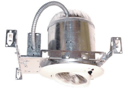
G-1 Self Contained Recessed Emergency Gimbal