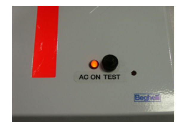
(self-powered units only)